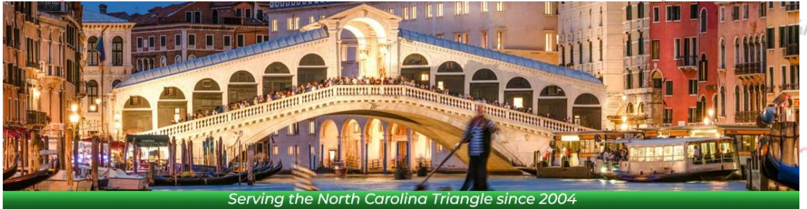
Serving the North Carolina Triangle since 2004