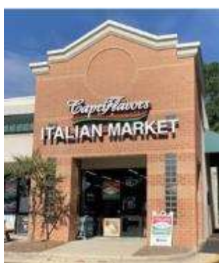
Wine Tasting at Capri Flavors