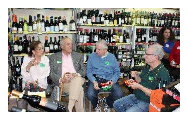
Great Food! Great People! Fantastic Wine. Don't forget to stop by Capri Flavors in Cary to get the triangles best selection of Italian wine, cheese, meats, pasta, and lots of other Italian products. They even have seeded Italian bread shipped in frozen from New York.